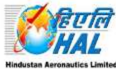
Hindustan Aeronautics Limited