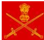
Ministry of External Affairs Government of India